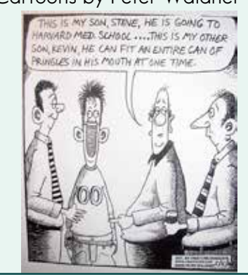
37 N Ferry Road • PO Box 2016 • Shelter Island, NY 11964

IN THE GALLERY Cartoons by Peter Waldner